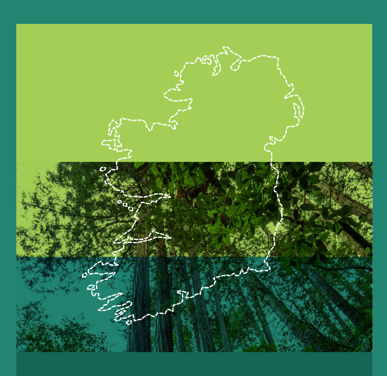
The All-Island Climate and Biodiversity Research Network